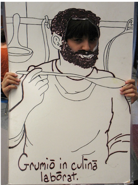
Stage 1, book 1...Latin students meet the colorful character, Grumio.