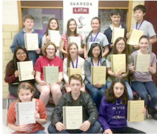
Latin II mod. 2 NLE award winners

perfect, the blossoms were gorgeous, and the food was plentiful (if not very authentic). It was a lovely way to celebrate together after months of really hard work.