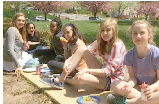
7 th grade girls find a sunny spot for the Latin picnic.