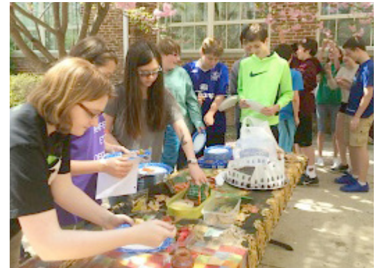
Picnic under the blossom to celebrate Rome's birthday (Colosseum cake in the background courtesy of Calder Lowenthal)